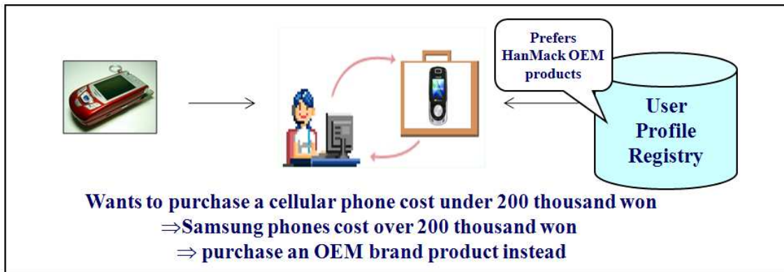
Figure 3. User Profile Analysis using Personalization Agent.

profile, and the search result of the Web Services analyzed by the Matchmaking Engine. The need to find out the most appropriate information through the analysis of user information profile and the produced result of the Web Services here, can be performed by the Rule-based Search Engine.