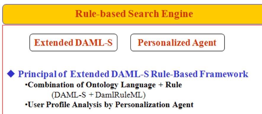
Figure 2. Principal of Rule-based Search Engine.

The Rule-based Search Engine performs Rule-based search which selects only the appropriate service in formations by comparing the query result produced from the Search Manager (Search Module) which is the user interface of the search engine and the rule of the user fetched from the user profile registry.