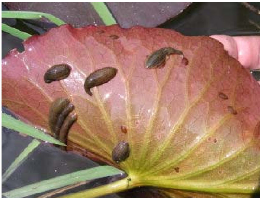
Figure 2. The main used bioindicator species - Erpobdella octoculata .

The Skalice River was heavily contaminated in 1986 with waste waters containing an estimated 1 metric ton of polychlorinated biphenyls that leaked from a road gravel processing factory in Rožmitál pod Třemšínem [26]. The aim of the study was to evaluate the use of the leeches of the genus Erpobdella as a means of assessing polychlorinated biphenyl contamination of watercourses. Monitoring for PCBs in the Skalice River began in 1992 and continued until 2003. Samples were collected from a single site upstream and at 10 locations downstream of the source of pollution covering a distance of about 50 km.