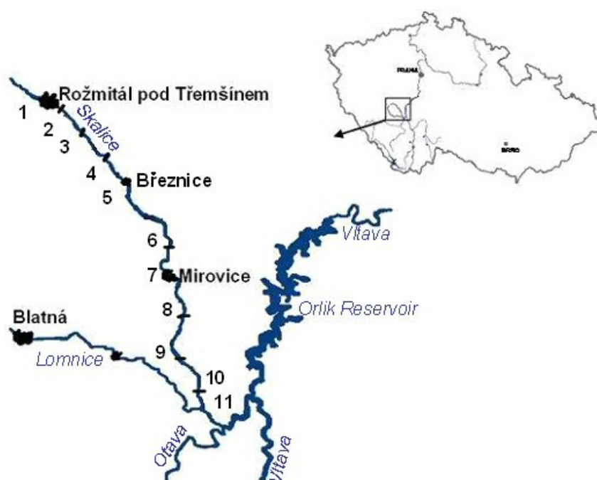
Figure 4. Locations of sites (Czech Republic).

A homogenous leech sample weighing 30 g was mixed with 100 g of anhydrous sodium sulphate to form a flowing powder and then extracted for 8 hours in a Soxhlet apparatus with 340 mL of a hexane-dichloromethane (1:1, v/v ) solvent mixture. The crude extract was carefully evaporated and dissolved in 10 mL of a cyclohexane-ethyl acetate mixture (1:1, v/v ) containing PCB 112 (this congener is not present either in commercial mixtures or environmental samples), employed as an internal standard.