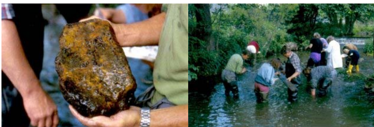
Table 1. Sample sites on the River Skalice