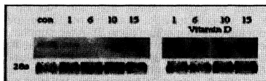
Figure 3. Northern blot analysis of gastrin mRNA from normal, cisplatin and cisplatin plus vitamin D treated animal stomachs. Note gastrin mRNA level was almost undetectable on day 1 and day 6 after cisplatin treatment but restored to normal levels at day 10.. In the animals pretreated with vitamin D, however, the gastrin mRNA levels were not lower after cisplatin treatment. The gastrin mRNA started to increase after day 10 of cisplatin treatment reaching above normal levels by day 15. Ribosomal RNA (28s) served as control for possible variation in sample RNA amount or integrity.

Rats were treated with cisplatin and cisplatin plus vitamin D. RNA from the rat stomach tissues was analyzed by the same methods to detect gastrin mRNA (Fig. 3). After 1 and 6 days since cisplatin treatment, the gastrin mRNA bands were almost undetectable, compared to the control. However, 10 days after cisplatin treatment the gastrin mRNA levels started to increase reaching levels found in the untreated animal around day 15. When vitamin D was given before cisplatin treatment gastrin mRNA levels were not reduced compared to the group that only received cisplatin. Interestingly the gastrin mRNA increased to greater levels by day 15. The equal amount of loading was shown by the equal intensity of the 28s bands.