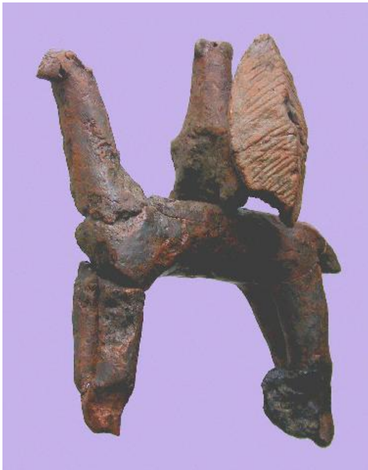
Picture 1 2 . Clay figurine of a horseman (total height:9,8 cm, length of the horse: 8,7 cm).

The same is true for a number of (mostly fragmented) figurines made from burnt clay which were also found in this grave: a horseman with a shield (picture 1),