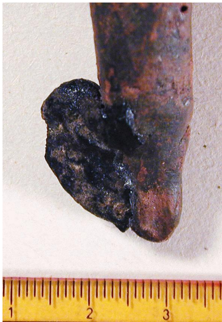
Picture 2 2 . Detail of picture 1, showing parts of the legs with the organic adhesive.

A small sample of this material (which was already broken away from one of the figurines) was used for chemical analysis. This should show whether or not this agglutinant is identical with the material which was used for many purposes in prehistoric central and northern Europe, i.e., whether or not it is birch bark pitch 3 .