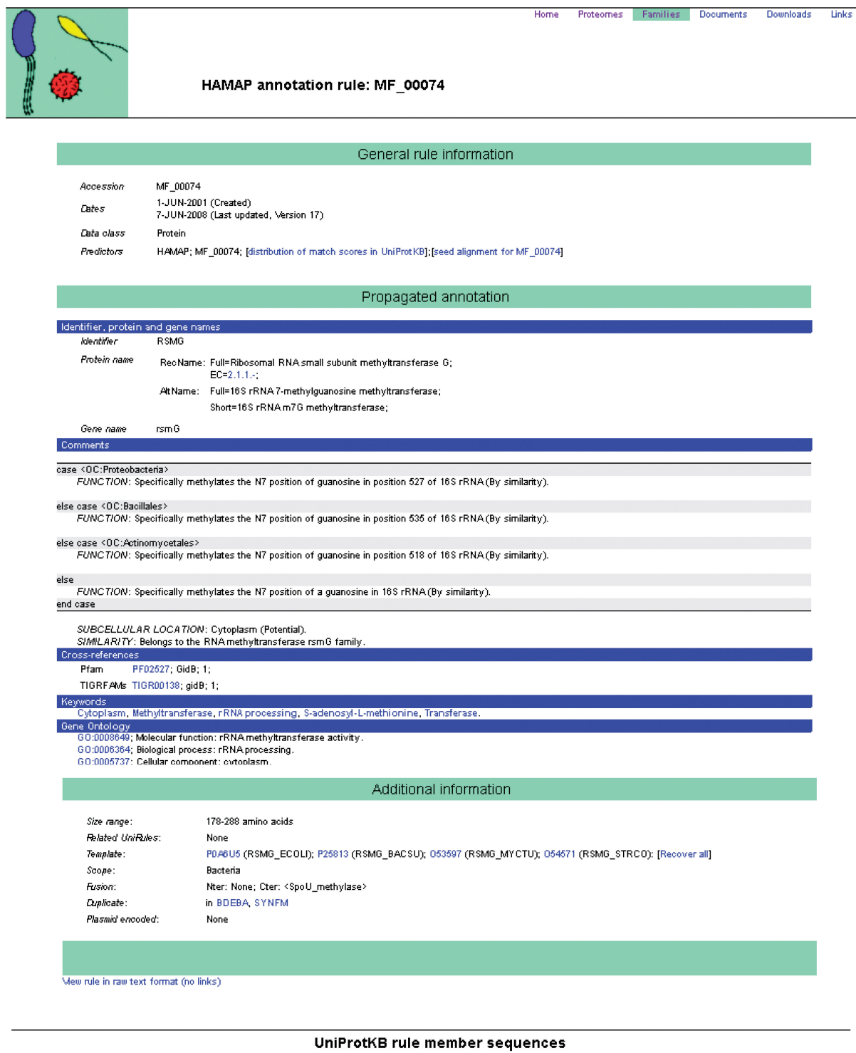
Figure 1. Example of a HAMAP protein family annotation template (family rule), MF_00074 ( www.expasy.org/unirule/MF_00074 ). Annotation templates contain three sections: 'General rule information', 'Propagated annotation' and 'Additional information'. General information comprises: family identification number (MF_xxxxx), dates of creation and revision, 'Data class', i.e. that the whole protein is annotated by the family rule and not only a specific domain, and 'Predictors', which contain the distribution of matches and the alignment that was used to generate the family profile. The 'Propagated annotation' section contains the information that is propagated to all members of a protein family, or to some, if the field is