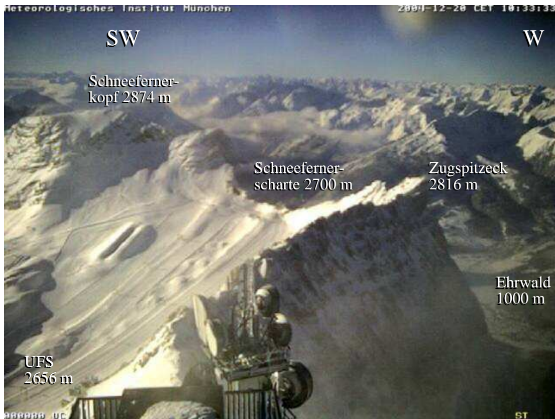
Fig. 2. Field of view of the camera with directions and the main landmarks.