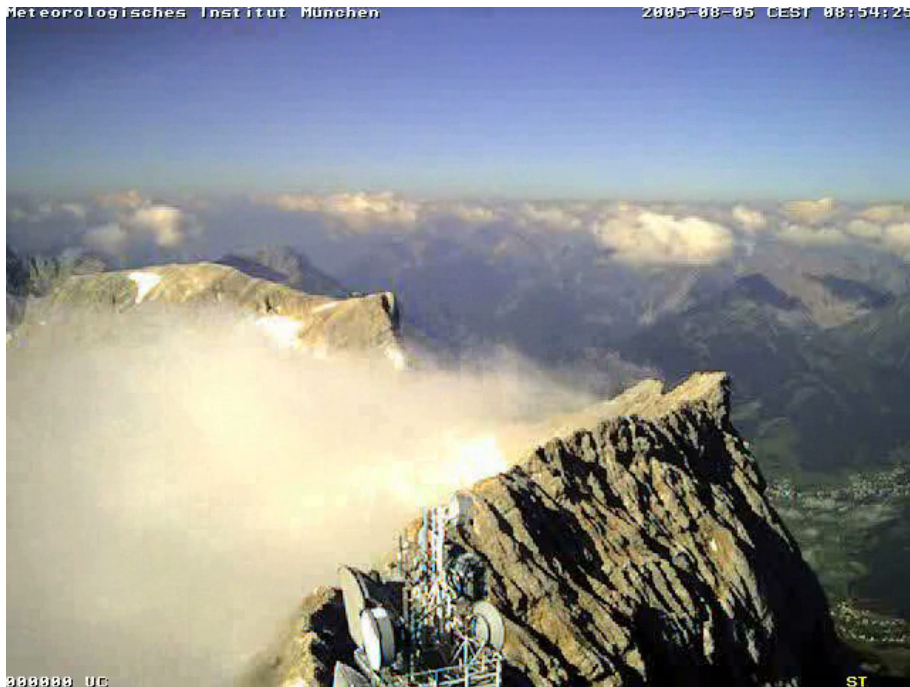
Fig. 6. Still image of movie acpd-2006-0262-m06.mpg from 5 August 2005 8:34–9:14. Wind blowing from the north i.e. from right to left. For the movie see supplemental material: http://www.atmos-chem-phys-discuss.net/6/9995/2006/acpd-6-9995-2006-supplement.zip and Appendix A.