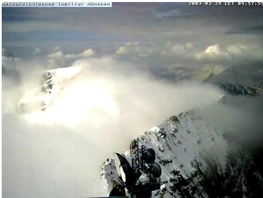
Fig. 8. Still image of movie acpd-2006-0262-m08.mpg from 29 March 2003 09:46–10:19. Wind blowing from the north i.e. from right to left. For the movie see supplemental material: http://www.atmos-chem-phys-discuss.net/6/9995/2006/acpd-6-9995-2006-supplement.zip and Appendix A.