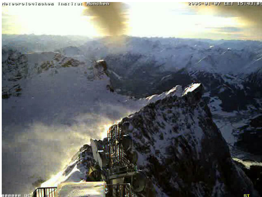
Fig. 10. Still image of movie acpd-2006-0262-m10.mpg from 7 January 2005 15:50–16:11. Wind blowing from the north i.e. from right to left. For the movie see supplemental material: http://www.atmos-chem-phys-discuss.net/6/9995/2006/acpd-6-9995-2006-supplement.zip and Appendix A.