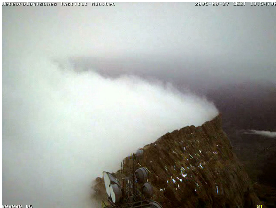
Fig. 4. Still image of movie acpd-2006-0262-m04.mpg from 27 August 2005 19:07–20:20. Wind blowing from the north i.e. from right to left. For the movie see supplemental material: http://www.atmos-chem-phys-discuss.net/6/9995/2006/acpd-6-9995-2006-supplement.zip and Appendix A.