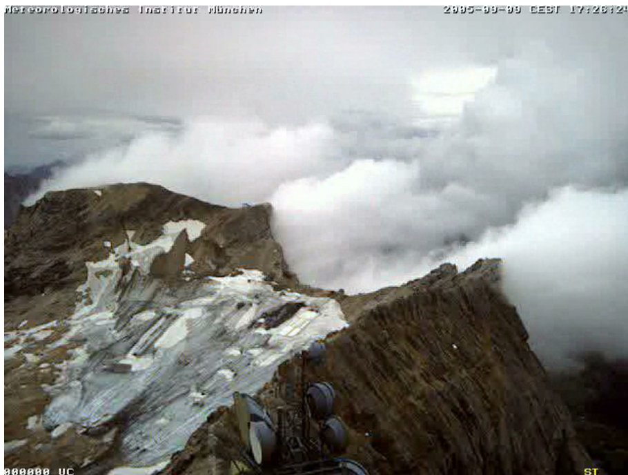
Fig. 9. Still image of movie acpd-2006-0262-m09.mpg from 9 September 2005 17:01–18:07. Wind blowing from the south east i.e. from left to right. For the movie see supplemental material: http://www.atmos-chem-phys-discuss.net/6/9995/2006/acpd-6-9995-2006-supplement.zip and Appendix A.