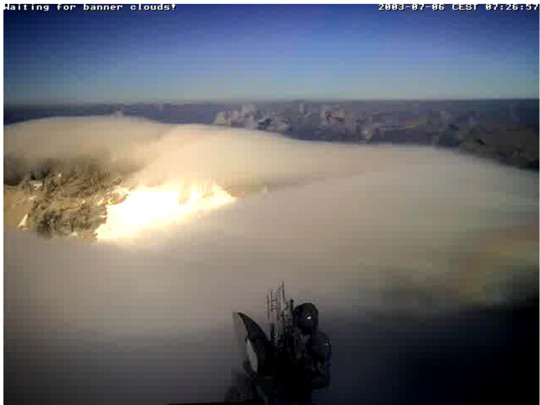
Fig. 5. Example of a cap cloud at mount Zugspitze from 6 July 2003 07:26. Wind blowing from the north-west i.e. from right to left.