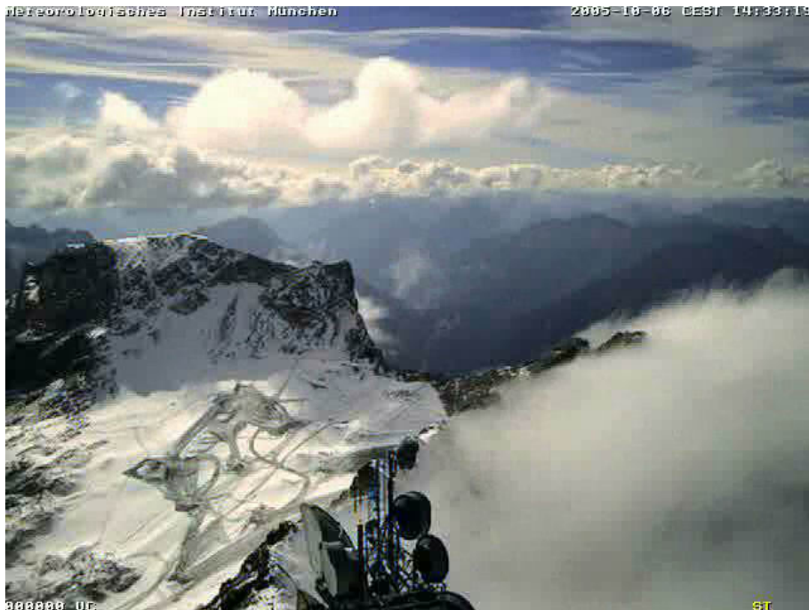
Fig. 7. Still image of movie acpd-2006-0262-m07.mpg from 6 October 2005 14:07–16:22. Wind blowing from the south i.e. from left to right. For the movie see supplemental material: http://www.atmos-chem-phys-discuss.net/6/9995/2006/acpd-6-9995-2006-supplement.zip and Appendix A.